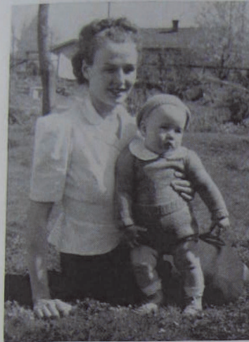
'Mother of the Month'